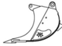
ST proved XHD-shape for rock