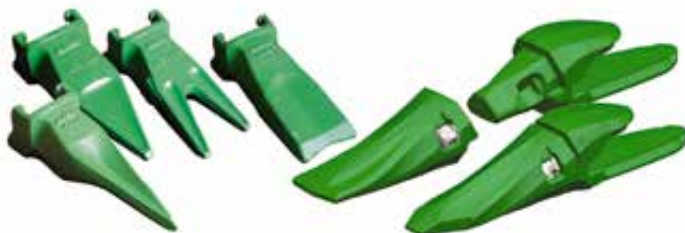
Standard tooth system is Esco Super V respectively the new Esco Ultralock system