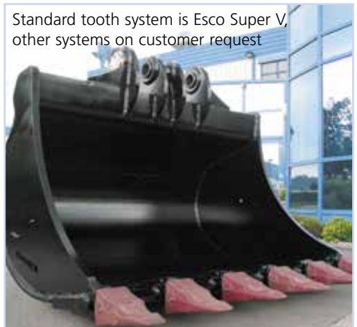
Standard tooth system is Esco Super V, other systems on customer request