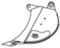
FK Standard bucket up to 600 mm width