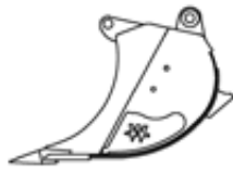
FI XHD-model with higher penetration ability