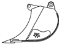
FG Standard bucket over 600 mm width