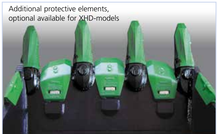
Additional protective elements, optional available for XHD-models

WIMMER Hartstahl GmbH & Co KG and WIMMER Felstechnik GmbH Industriestraße 3, A-5303 Thalgau, AUSTRIA, Tel. +43 (0)6235 6655-0, Fax DW-18